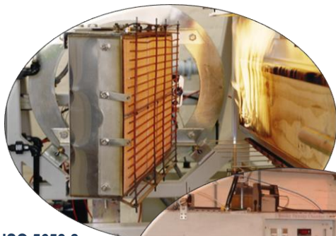
ISO 5658-2 "Flame spread test apparatus"

"providing quality testing from its UKAS approved laboratory"